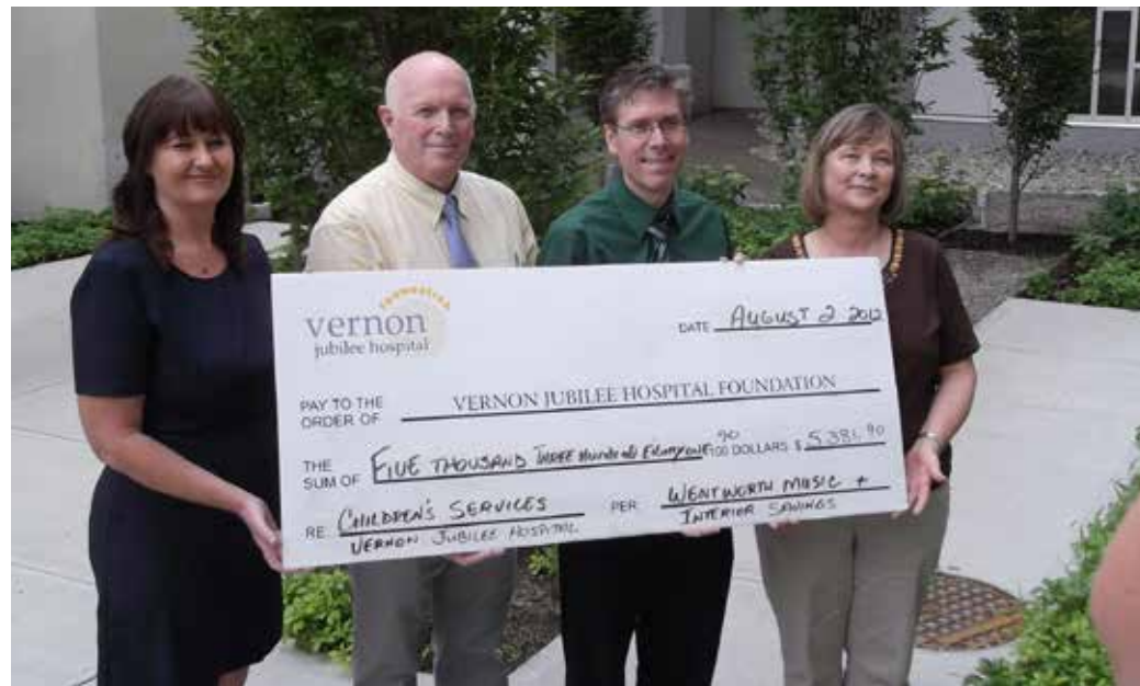
Wentworth Music and Interior Savings raised funds for Pediatric Care