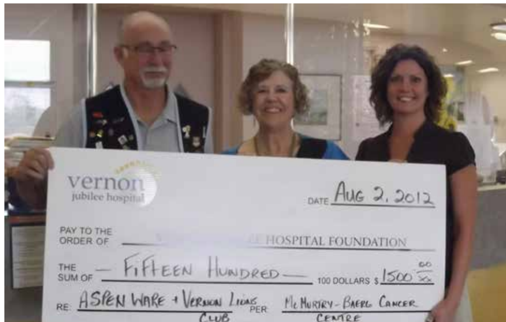
Aspen Ware and Vernon Lions Club helped to support the Cancer Centre expansion